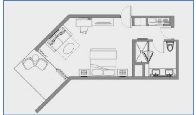
Sample Floor Plan